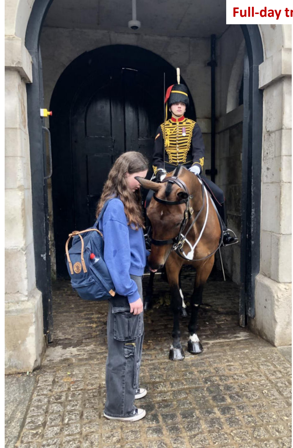
Full-day trip to London