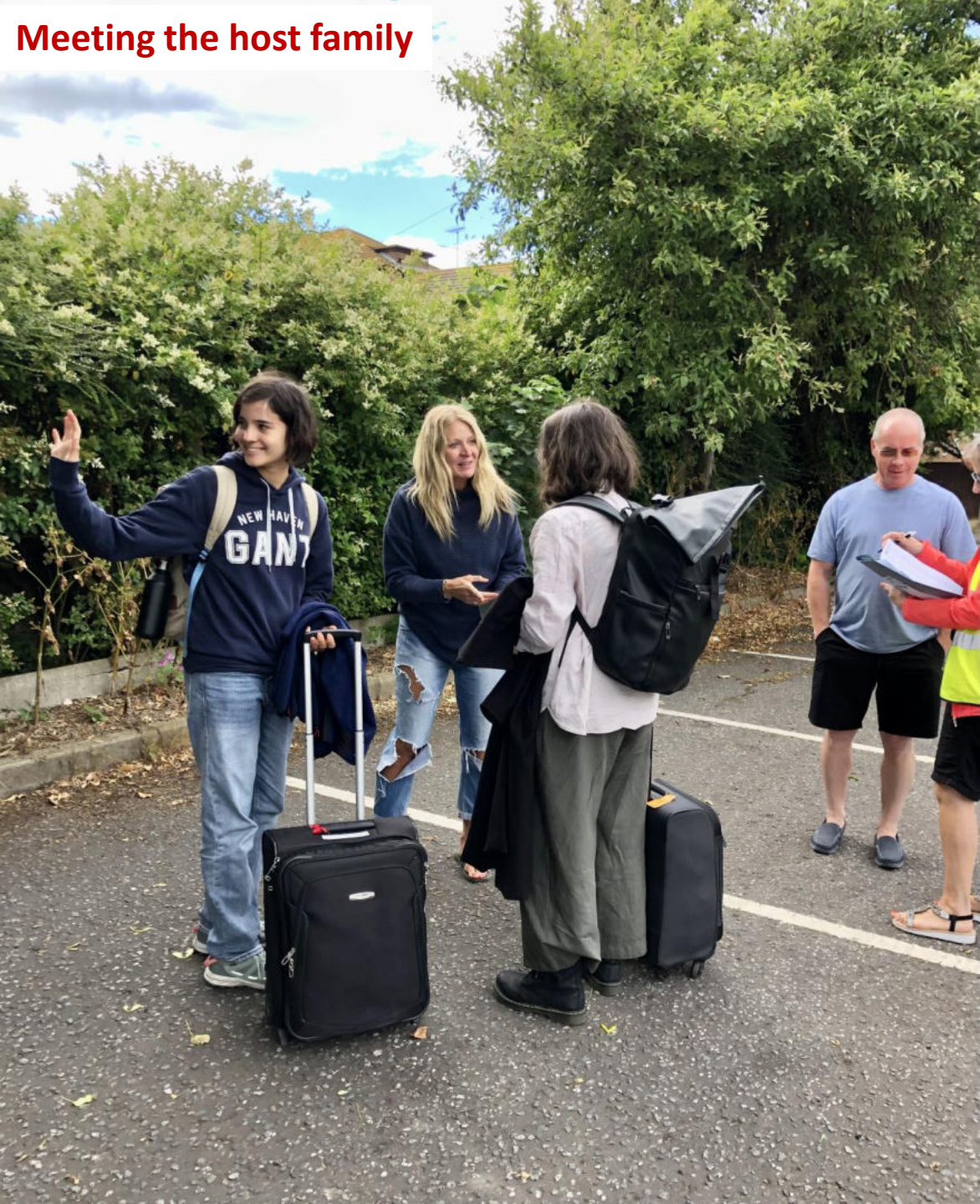
Meeting the host family